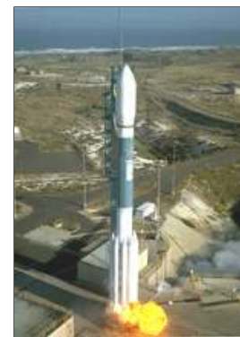
Delta II launched in 2000 from Vandenberg Air Force Base, California.