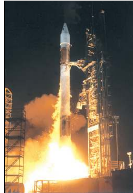
Atlas vehicle carrying the DSCS III B13 spacecraft into orbit in October 1997.

Space launch failure in a closed society like the USSR or the People's Republic of China was guarded as a state secret and not publicized in news media. Recently, though, because of "glasnost" in Russia, commercial competition, and requirements by the launch service insurance company, information flow on space activities has improved dramatically. Since the collapse of the USSR on December 26, 1991, CIS has released information on many USSR space launch vehicle failures that were not previously known to the West. Making this information accessible has provided a much more complete picture of worldwide space launches, although the vast amount of information existing in CIS/USSR from both successful and failed launch operations is yet to be assimilated by space launch communities of the world.