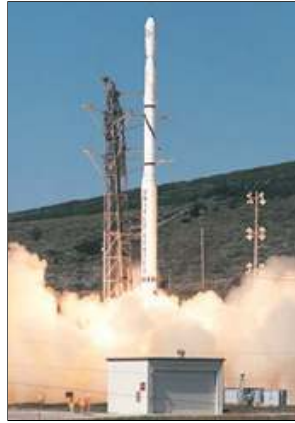
Scout lifting a radar calibration satellite into orbit in June 1993.

In Japan, the National Space Development Agency (NASDA) and the Institute for Space and Astronautical Science (ISAS) are responsible for space research and development. The NASDA H-II and ISAS Mu-5 vehicles use state-of-the-art technology and represent the Japanese government's commitment to becoming a major player in space. Japan had an 18-year streak (1977–1994) of successful consecutive space launches.