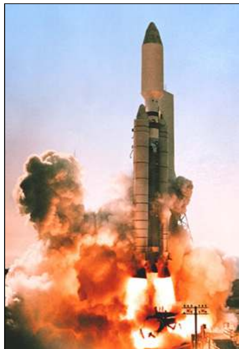
Titan IV, the Air Force's premier heavy lift vehicle, launched from Vandenberg Air Force Base on November 28, 1992.

Many current major space launch systems are based on