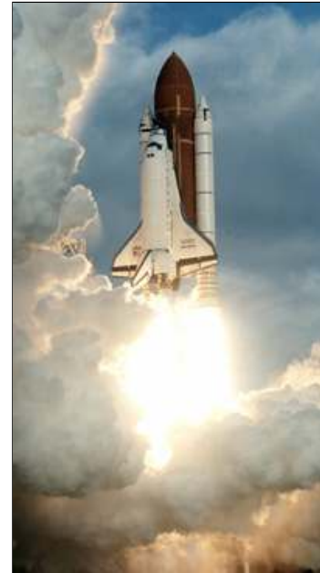
An early morning liftoff of the space shuttle Discovery from Kennedy Space Center on November 27, 1989.

China and Japan have also invested heavily in space programs. China's government publicized its first two successful space launches—in 1970 and 1971—as great national achievements in science and engineering. The Chinese CZ-2C vehicle holds a perfect record for Chinese launchers of 11 launch successes. Over the last few years, the Chinese government has made considerable investment in improving its launch-base infrastructure to gain a greater share of the commercial space market.